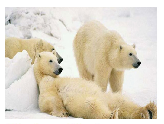
McCarty Glacier - Alaska

Save not only the Arctic Bear, save yourself.